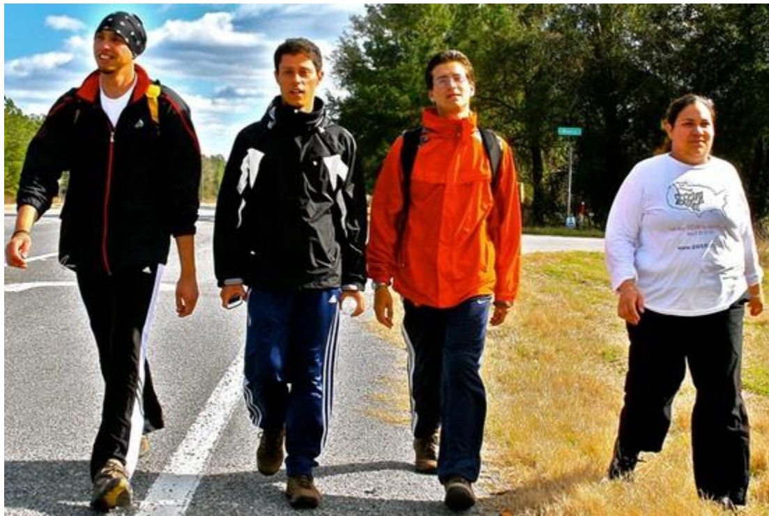
Trail of Dreams